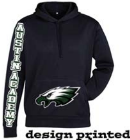
Color: Black design printed on pocket