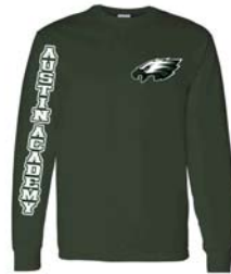
Color: Dark Green