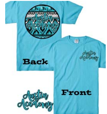
Aztec Print Austin Academy T-shirt