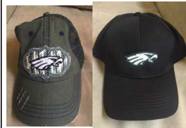
Green Hat Black Hat