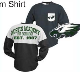
Color: Black and White