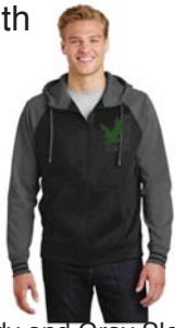
Color: Black Body and Gray Sleeves